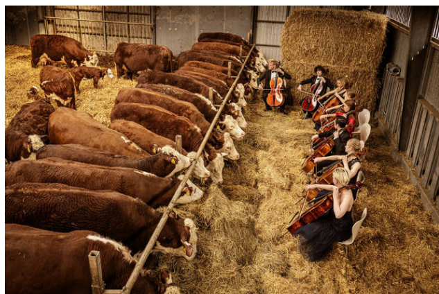
Eight cellists play recital for Hereford cows.

It's true! Moove on over to this article to read about it HERE .